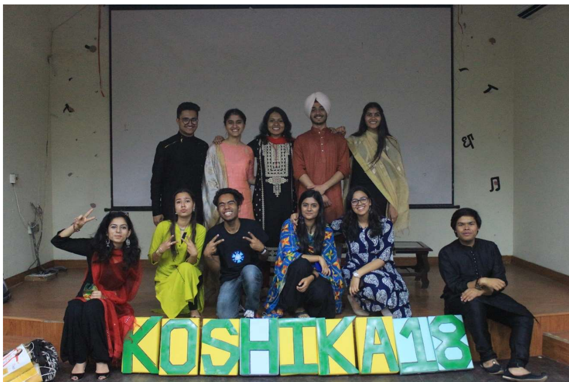
Editorial Team of Verdure 2018 and Committee Members of Koshika 2018