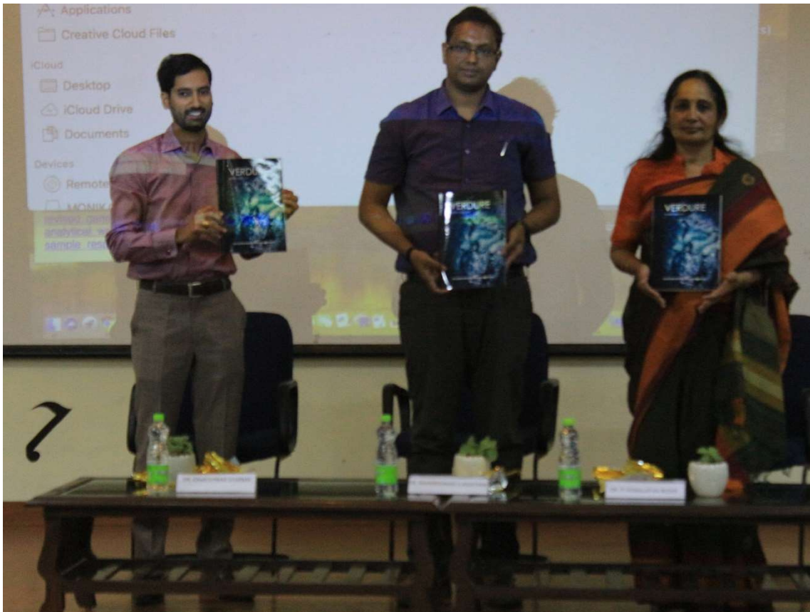
Release of Biological Science Annual Magazine “Verdure” Second Edition